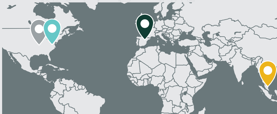
—Incoming class of 2023 global experiences

Students take a deep dive into Olin's Values Based, Data Driven™ approach to decision-making before hitting the road. The first trip takes you to the inner halls of the US government in Washington, DC. International locations for the fall and spring have included Barcelona, Spain; Paris, France; Santiago, Chile; Shanghai, China; and Singapore.